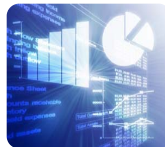
Business Intelligence, Analytics & Reporting