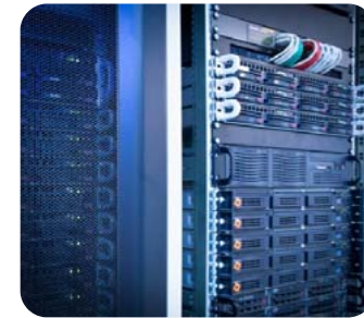
IT Infrastructure, Cloud & Managed Services