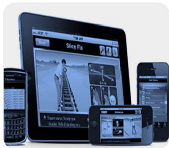
Mobile Application Development