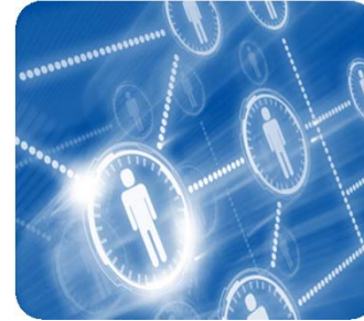
HRMS/Employer System Implementations