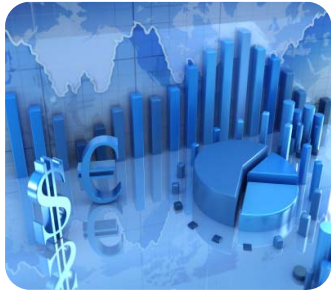
ERP/Accounting System Implementations