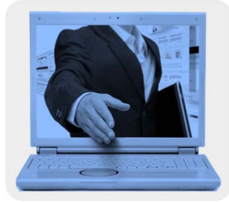
CRM System Implementations