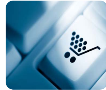
Web Development & eCommerce